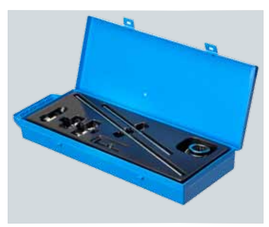
Complete circle cutting device Article no. 80600210

For the Zeta 100 plasma cutter, there are two air-cooled, robust types of torches for manual or automated cutting and gouging. As standard, the Zeta 100 is supplied with a 6 m complete plasma hose for manual cutting. For an automated cutting setup, an automatic torch for mounting in fixture can be supplied. Both types of torches use the same cutting/gouging wear parts and can be used for alle types of materials.