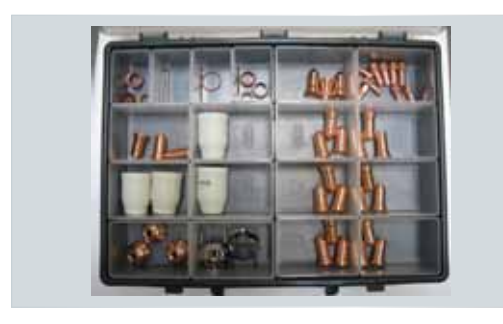
Wear parts kit Article no. 81100239

MIGATRONIC ZETA 100 PLASMA TORCH -FULLY EQUIPPED, READY FOR USE