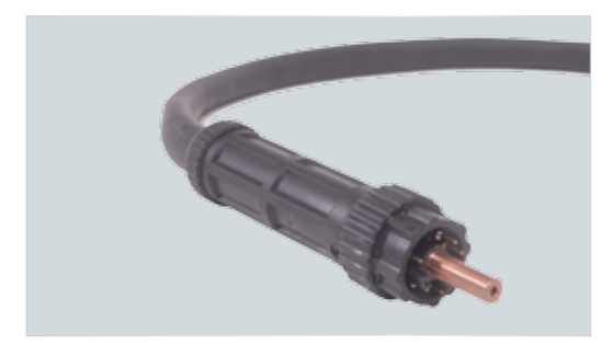
Application solution: ZA model

Both torches are designed with a safety circuit for protection of the user which ignites by means of the Pilot arc and without use of HF. This patented system ensures long service life of wear parts and prevents EMC noise in the supply network.