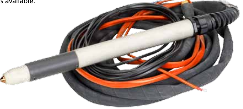
Plasma torch Automation, 6 m complete Article no. 80690096

MIGATRONIC ZETA 100 PLASMA TORCH -FULLY EQUIPPED, READY FOR USE