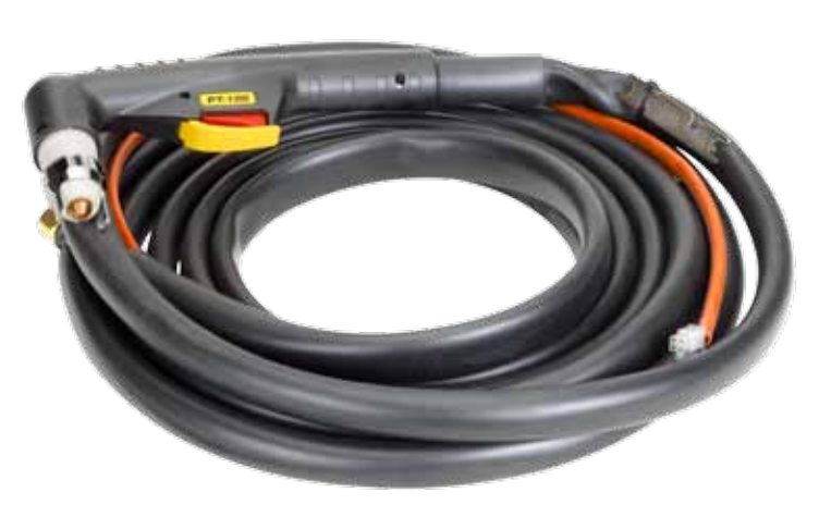
Plasmas torch, 6 m complete Article no. 80690095