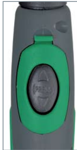
Article no. 80300100 Keypad unit Standard equipment