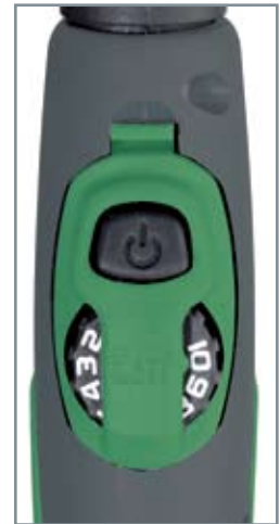
Article no. 80300273 Keypad unit with horizontal MIG control knob (RH). Extra equipment for analogue adjustment.